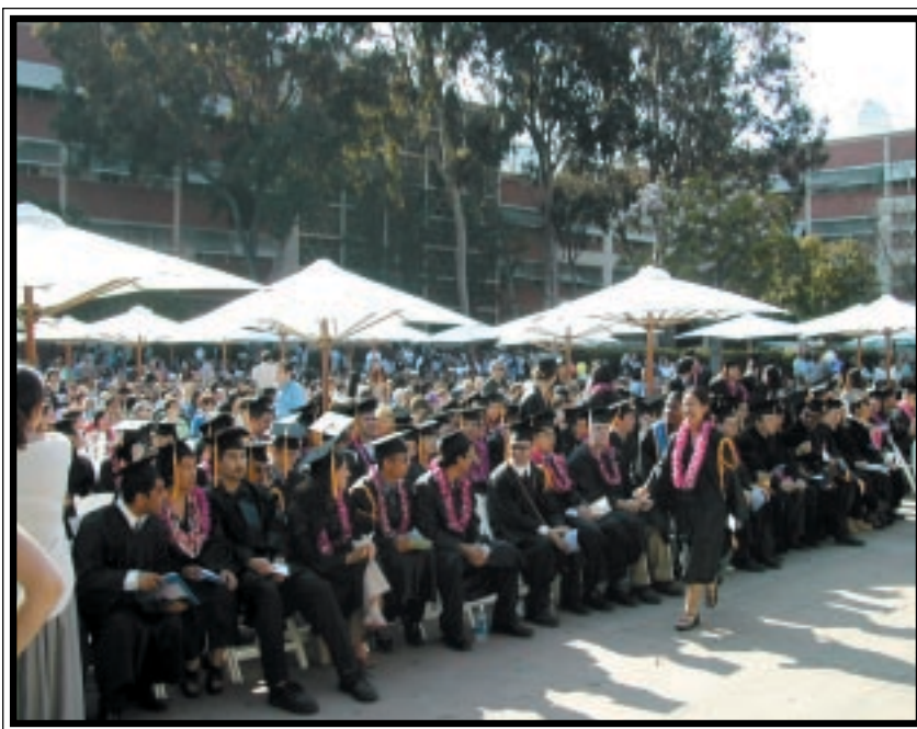
June 2003 Chemistry and Biochemistry Commencement

SAVE THE DATE Saturday, December 6, 2003