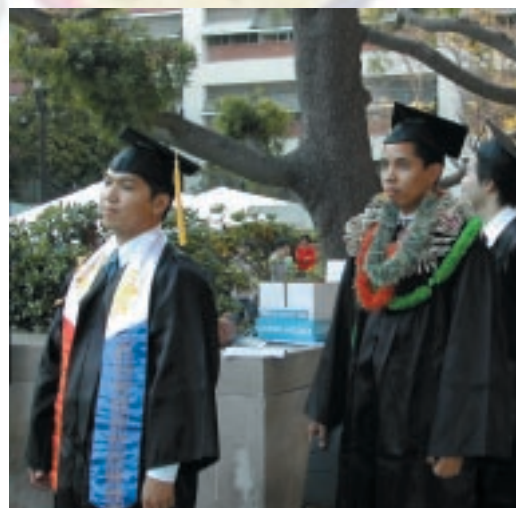
Waiting Their Turn