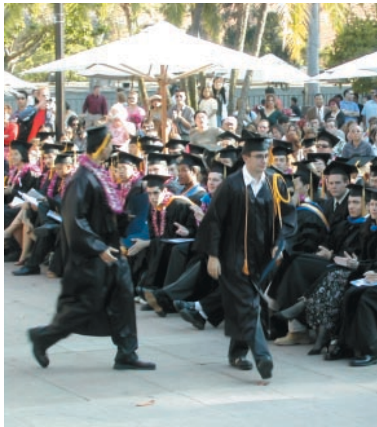
Race to the Finish